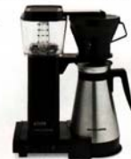
Thermal Carafe, Black Metallic

new #4 White Coffee Filters #27-2517233 $5.00