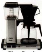
Glass Carafe, Brushed Silver